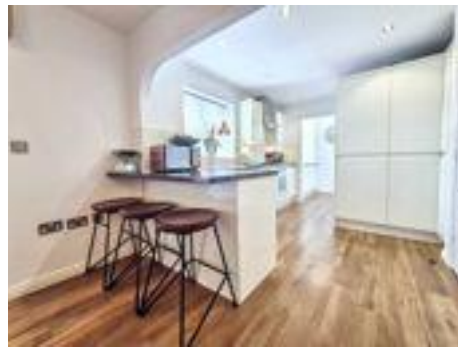
Kitchen / Diner.....