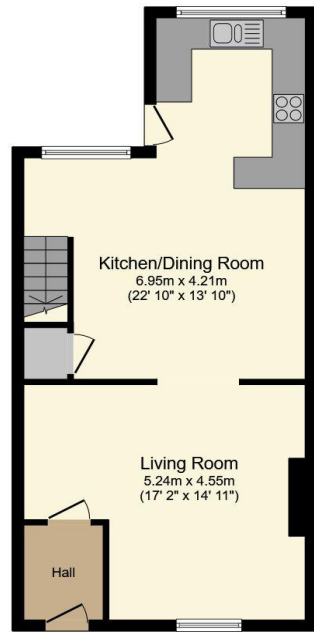
Ground Floor Floor area 52.7 sq.m. (567 sq.ft.)