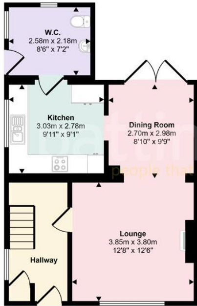
Ground Floor Approx 47 sq m / 506 sq ft

Approx Gross Internal Area 89 sq m / 953 sq ft