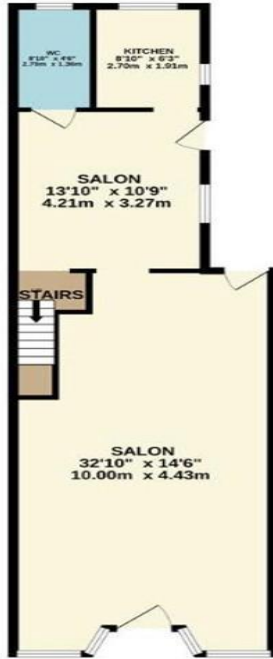
1ST FLOOR 622 sq ft. (57.3 sq.m.) approx.