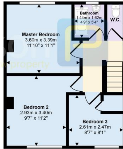
First Floor Approx 39 sq m / 425 sq ft

This floorplan is only for illustrative purposes and is not to scale. Measurements of rooms, doors, windows, and any items are approximate and no responsibility is taken for any error, omission or mis-statement. Icons of items such as bathroom suites are representations only and may not look like the real items. Made with Made Snappy 360.