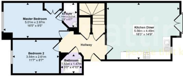
Ground Floor Approx 64 sq m / 689 sq ft

Approx Gross Internal Area 121 sq m / 1303 sq ft