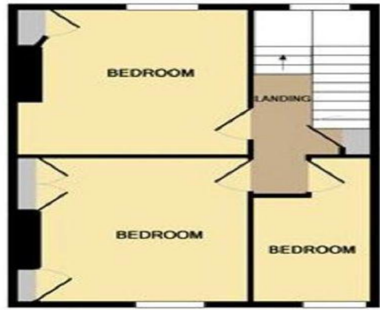
1ST FLOOR APPROX. FLOOR AREA 428 SQ.FT. (39.7 SQ.M.)

TOTAL APPROX. FLOOR AREA 972 SQ.FT. (90.3 SQ.M.)